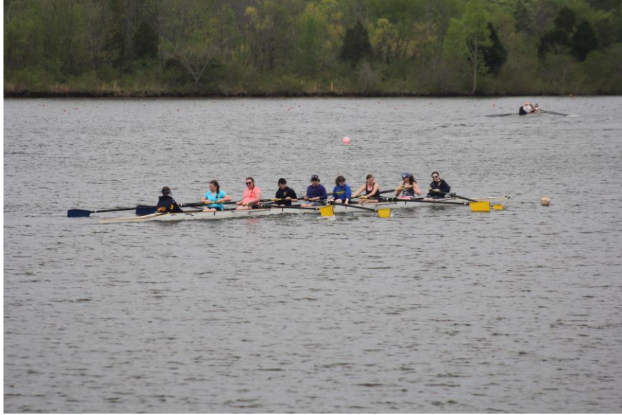
Caption: IMG_9802c.jpg: The wooded eastern shoreline would have been altered drastically had the coal barge terminal been built and there would not be any rowing there today

(As published in The Oak Ridger's Historically Speaking column on May 26, 2014)